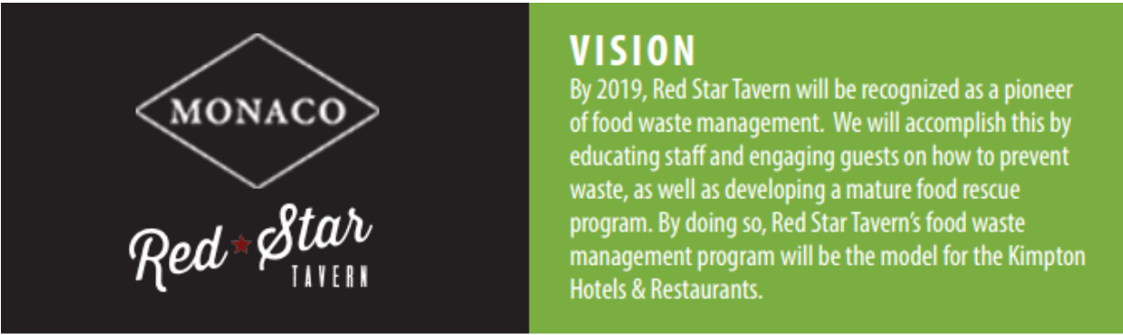
EXHIBIT A – THE ROADMAP