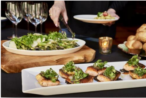
The new salmon buffet presentation from the zero-waste menu

Tied to and integrated with the zero waste menu sales is the effort to cultivate a working partnership with clients by engaging them on the topic. This is achieved first by orienting the sales team to the issues of food waste, then through direct discussion with the clients, supported by a one-page brief (detailed in the “Training” section below).