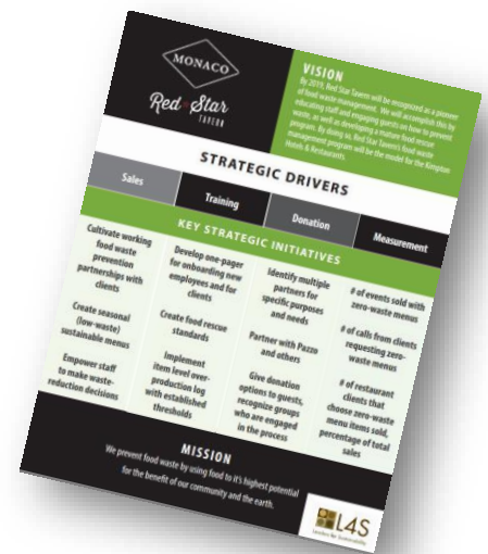
Red Star Tavern Roadmap (full-sized version in Exhibit A)